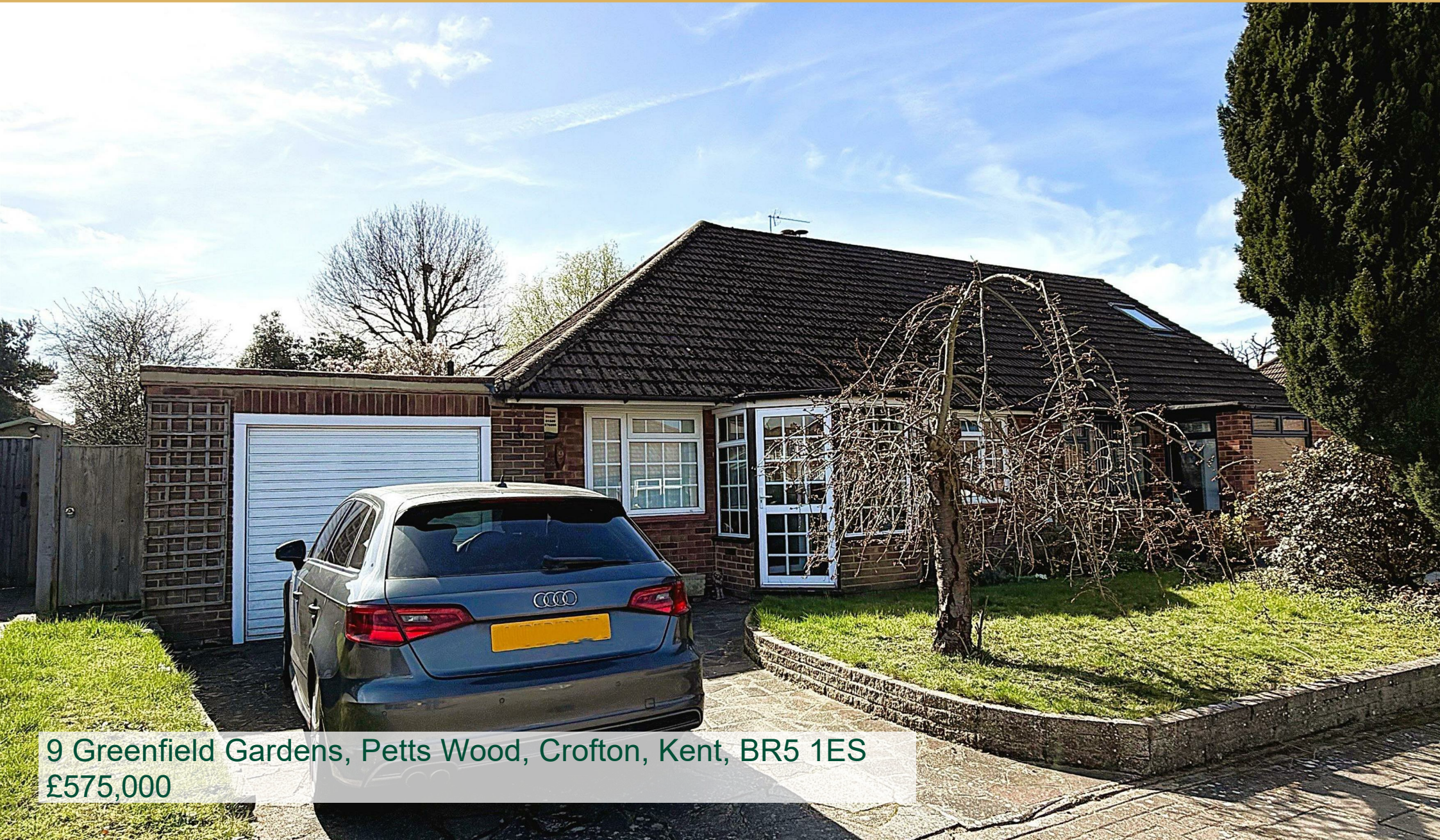
9 Greenfield Gardens, Petts Wood, Crofton, Kent, BR5 1ES £575,000